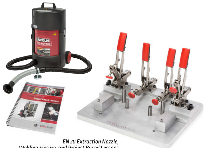
EN 20 Extraction Nozzle, Welding Fixture, and Project Based Lessons